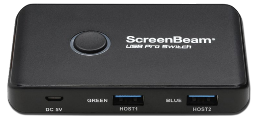
CATALOG NUMBER SBUSBSW4 ScreenBeam USB Pro Switch

Not every meeting space is equipped with an MTR. So for those spaces ScreenBeam USB Pro Switch provides users the flexibility to choose to go wireless or wired for their BYOM session, allowing guest presenters with locked down devices to still drive the meeting.